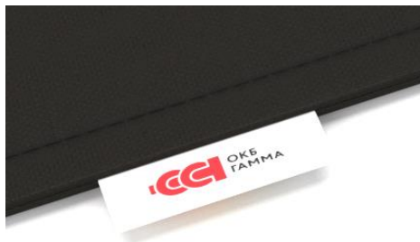
Sew-on label with customer logo