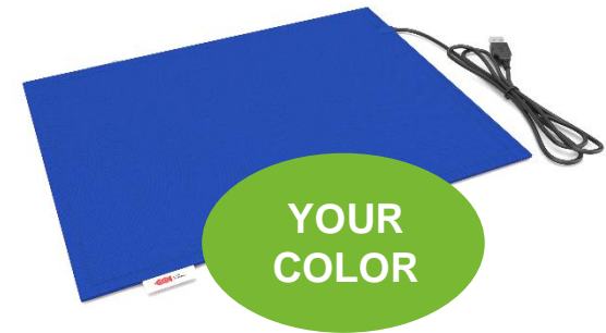
Making a pad in the customer's corporate colors *