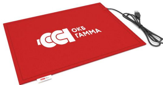
Application of the customer's logo on the pad